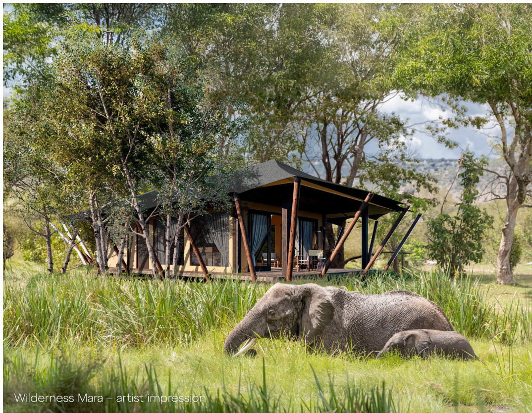
Wilderness Mara – artist impression