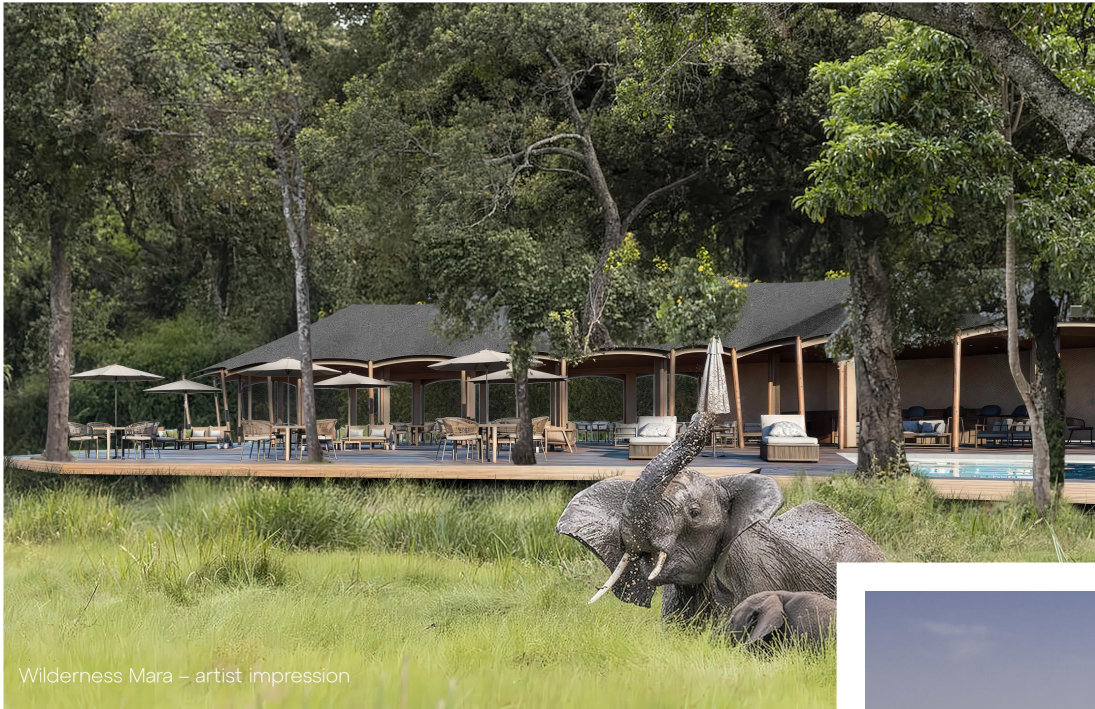
Wilderness Mara – artist impression