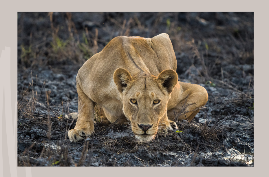
Meet the limited-edition Wilderness Mokete on an epic Botswana adventure