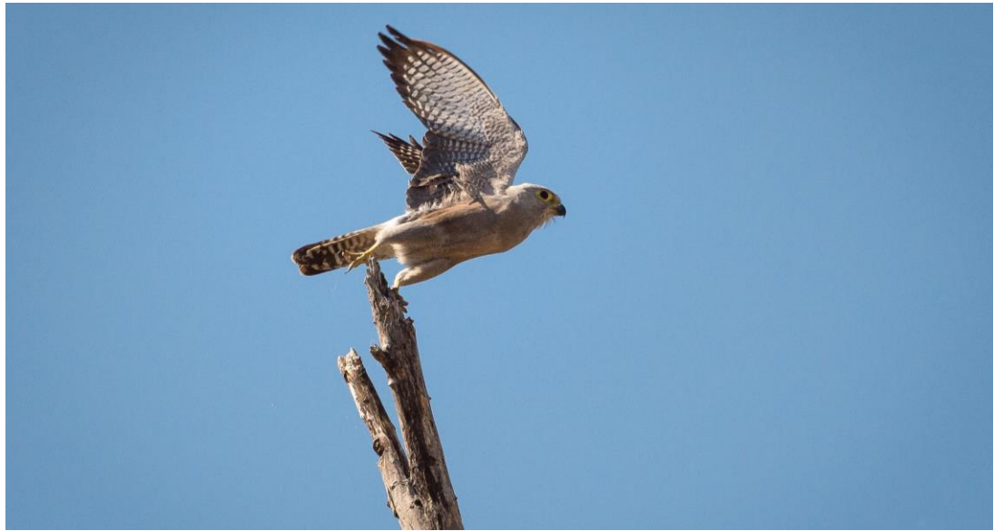
NATURE WALK & BIRDING