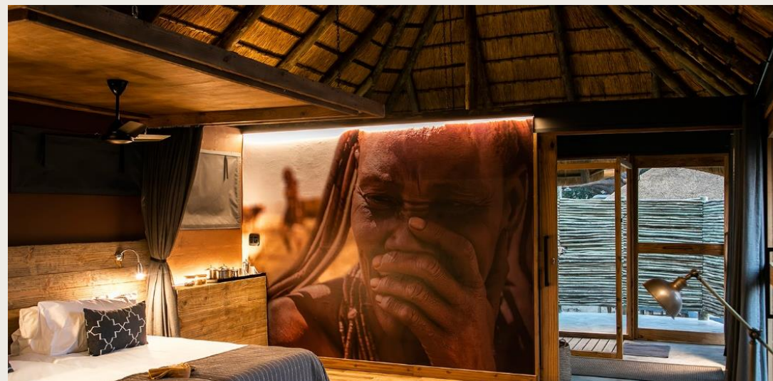
MAIN AREA & SUITE