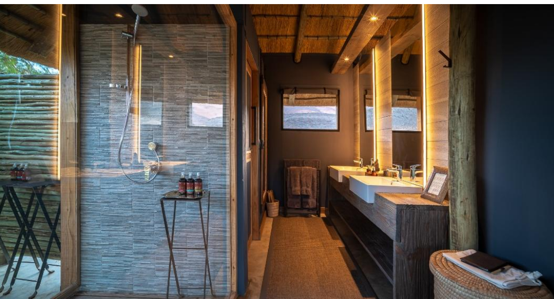
OUTDOOR SHOWER, BATHROOM