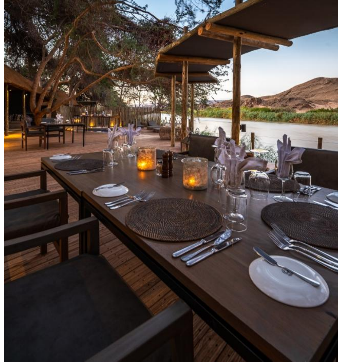
MAIN DINING AREA