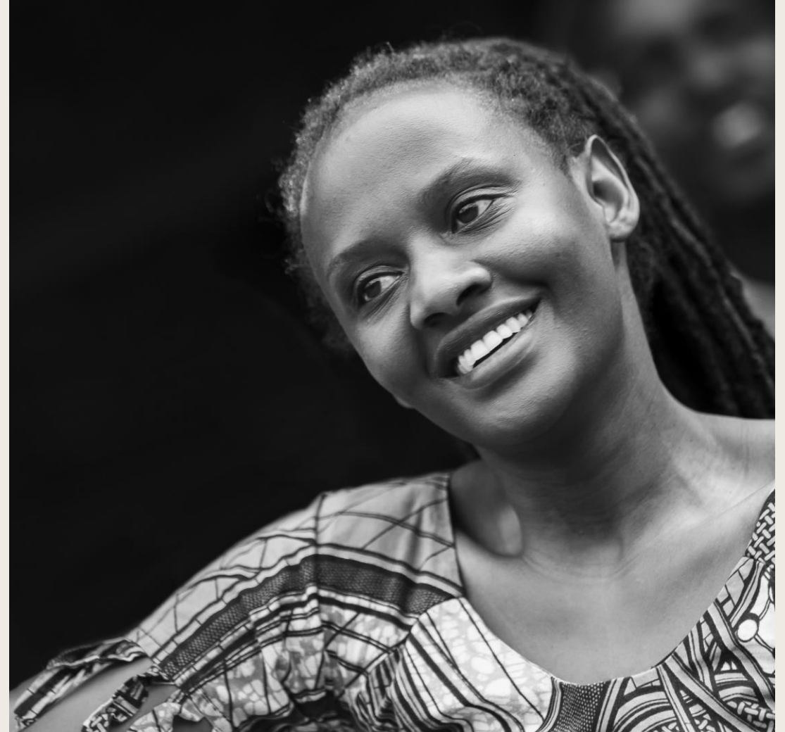
BISATE RESERVE WELCOME