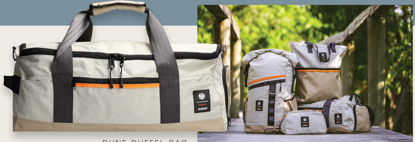
DUNE DUFFEL BAG

Standard travel gear is often too bulky for our aircraft and doesn't meet the necessary specifications. However, items like our Wilderness x Sealand Dune Duffel Large have been designed to fit perfectly. Built to withstand the elements, these bags are weather-resistant, durable, and resistant to rips and tears – making them ideal for any adventure in the wilderness.