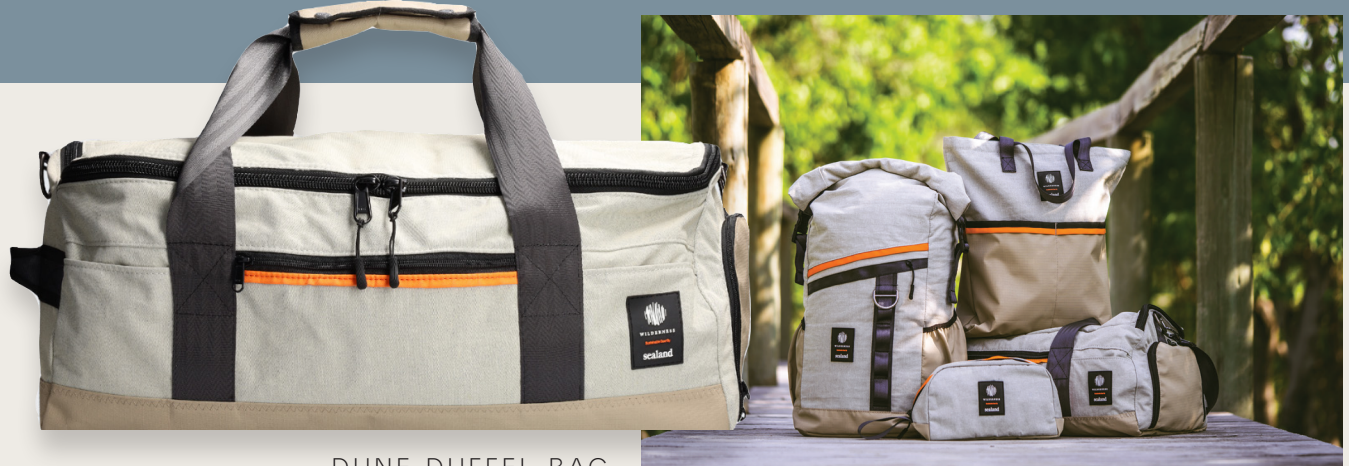
DUNE DUFFEL BAG

Standard travel gear is often too bulky for our aircraft and doesn't meet the necessary specifications. However, items like our Wilderness x Sealand Dune Duffel Large have been designed to fit perfectly. Built to withstand the elements, these bags are weather-resistant, durable, and resistant to rips and tears – making them ideal for any adventure in the wilderness.