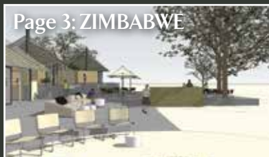
Linkwasha Camp set to open in 2015