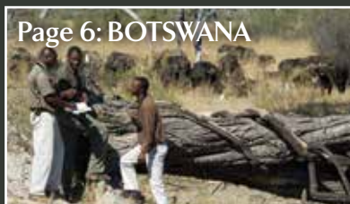
Guiding our way to success