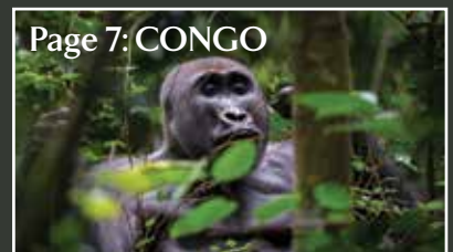
New silverback in Odzala