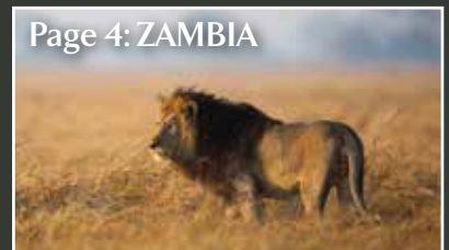
Busanga Plains of Plenty