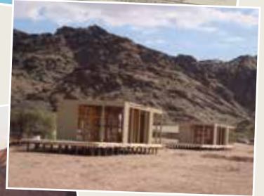
Construction is on track

2014 season launch special – R6 000 per person per night (discounted further for children), including a scenic flight to the Skeleton Coast on stays of three nights or more.