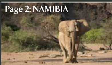
Update on Hoanib Skeleton Coast Camp