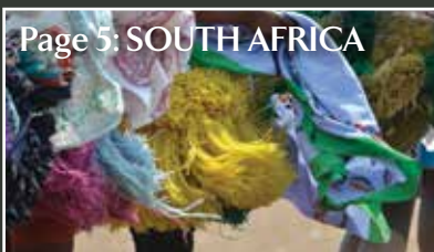
Shangane Cultural Festival