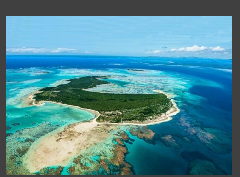
New kid on the block for 2017 Miavana

Death Traps and Bone Collectors and streams that disappear into vast underground lakes... plus rock eating termites with magnesium mandibles!