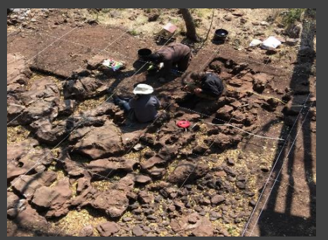
Tour of the Month Malapa Fossil Tour

celebration Marble is а quintessential South African fare and cooking-on-fire. Marble embodies South Africans' love of cooking with