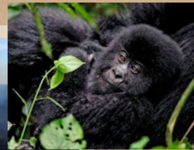
GORILLA TRACKING IN VIRUNGA