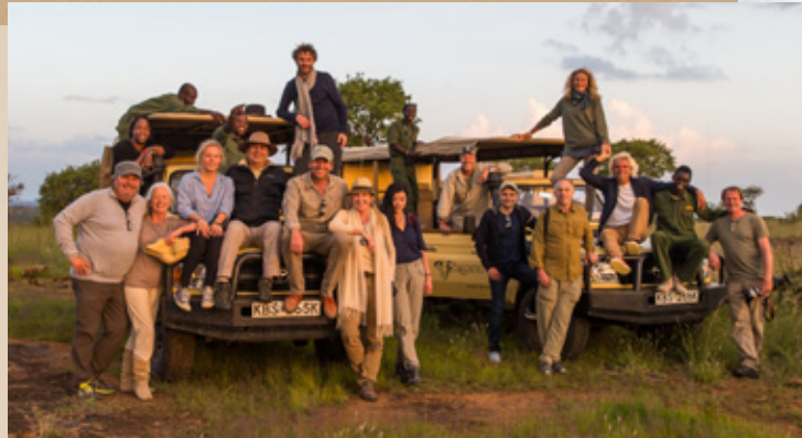
THE SEGERA LEADERSHIP GATHERING