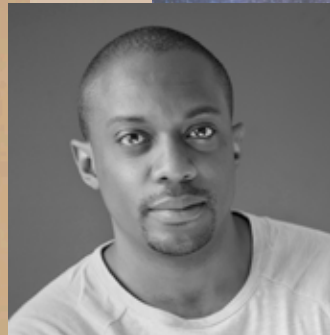
HANK WILLIS THOMAS