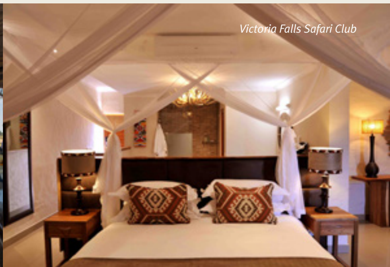
Victoria Falls Safari Club