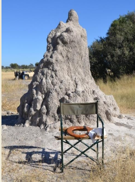
Loo with a view