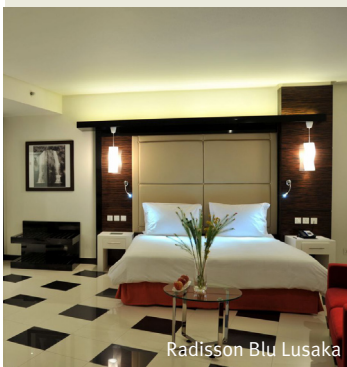
Radisson Blu Lusaka