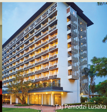
Taj Pamodzi Lusaka