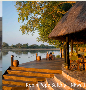
Robin Pope Safaris – Nkwali