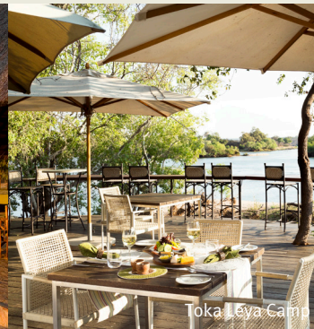
Toka Leya Camp