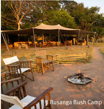
Busanga Bush Camp

Anabezi Camp | Chiawa Camp | Sausage Tree Camp