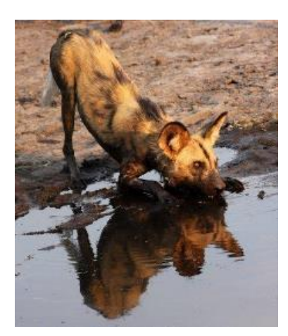
Warm Regards The Wilderness Explorations team