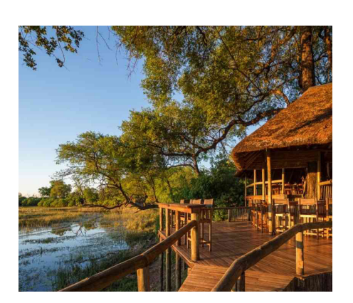
LITTLE VUMBURA CHITABE SAVUTI