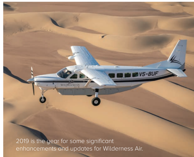
2019 is the year for some significant enhancements and updates for Wilderness Air.

Last but not least, this year we opened two new lounges in Kasane and Maun. The Maun lounge is based at the Wilderness Air offices, and the Kasane lounge is based in the airport's Domestic Terminal Building. Both offer seating and dining facilities in a fully air-conditioned space, with full Wi-Fi, TV, beverages (alcoholic and non-alcoholic) available, as well as meals on request. Guests have full access to these facilities whilst waiting for their flights, and dedicated personnel are on hand to ensure all guests' needs and comfort are met.