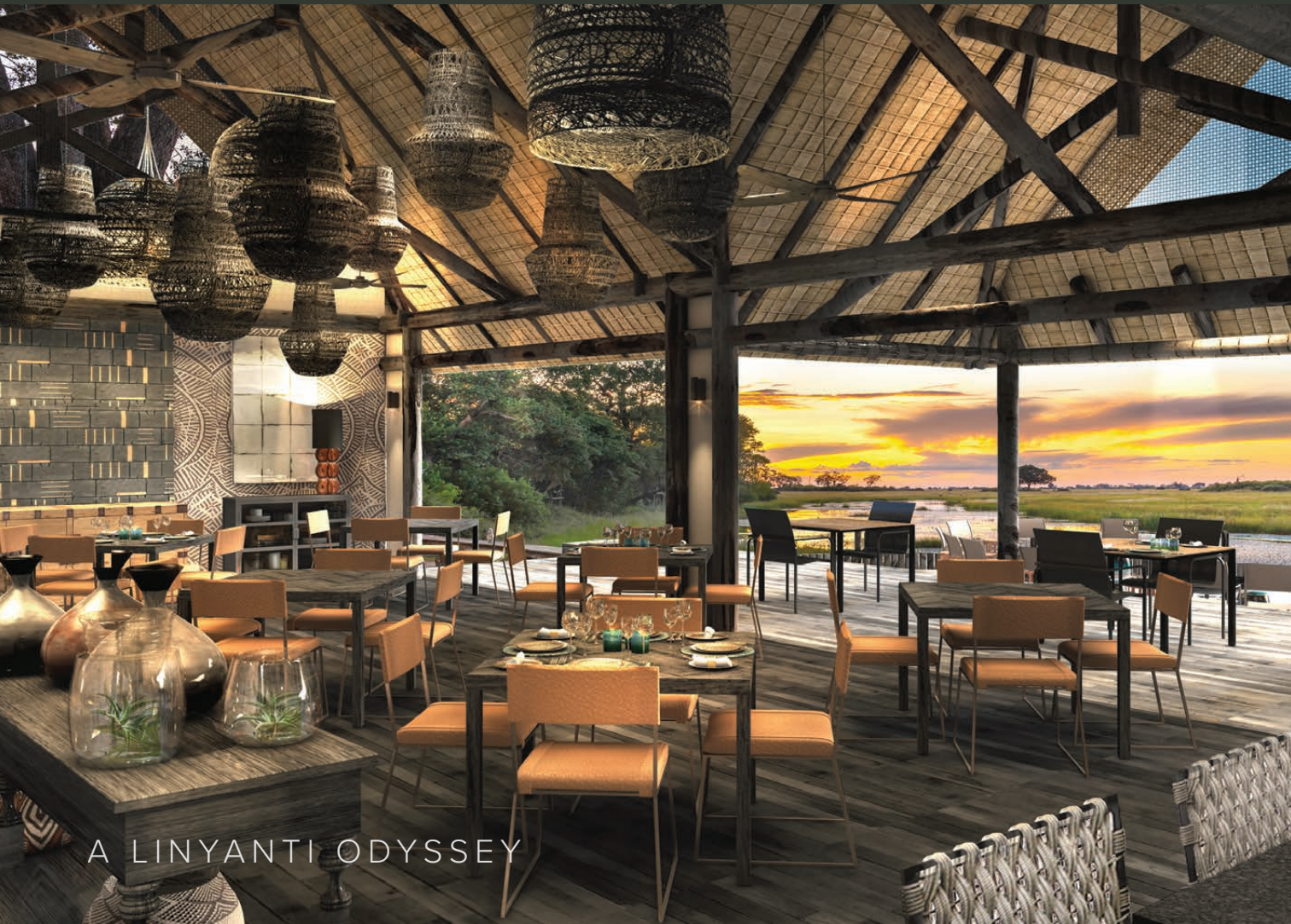
A LINYANTI ODYSSEY