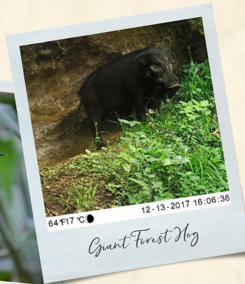
Giant Forest Hog