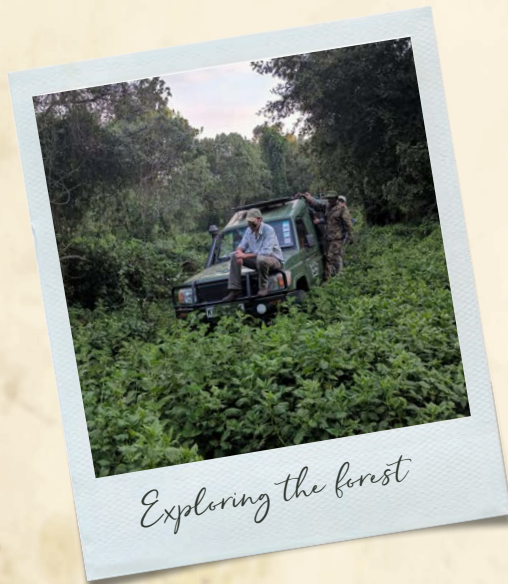
Exploring the forest