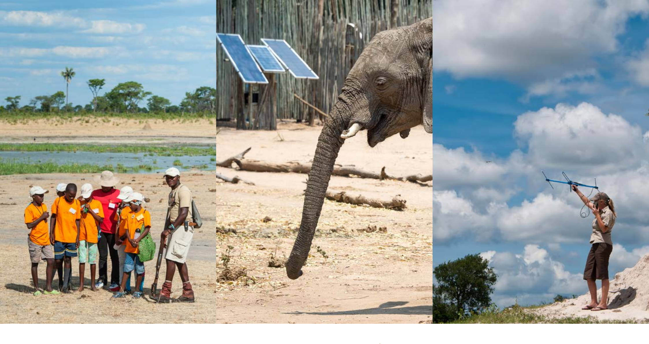
Our journeys change lives