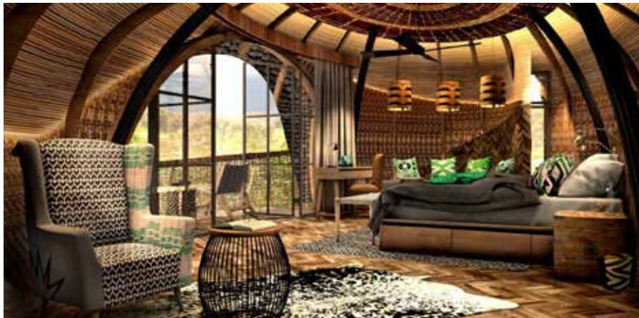
Bedroom Interior – artist's Impression