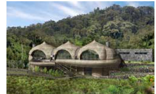
Main Area – completed future reforestation