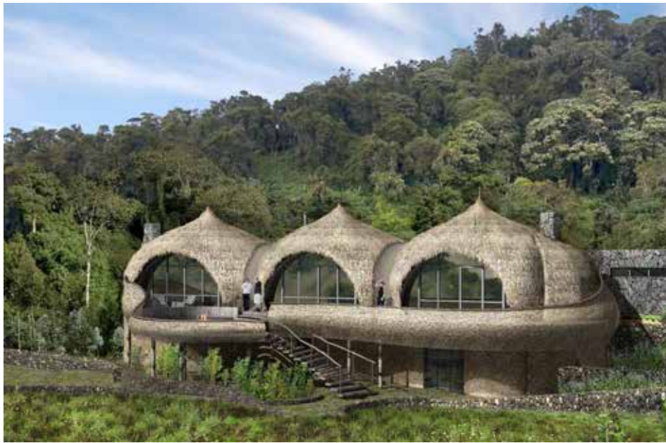
Main Area – artist's impression – with completed future reforestation