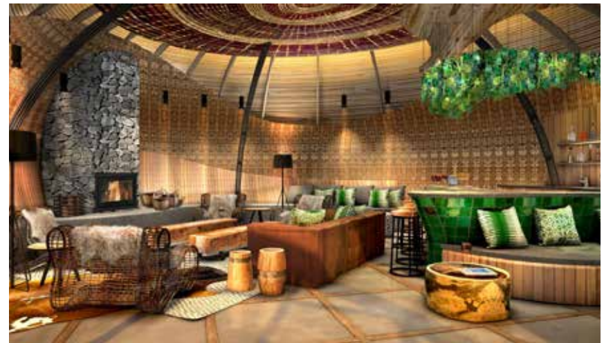
Lounge / Bar Area – artist's Impression

Bisate's sophisticated architectural and interior design is rooted in Rwandan building tradition as exemplified in the design of the Royal Palace of the traditional monarch. This spherical, thatched structure echoes the thousands of hills that dot the Rwandan landscape, while the richly detailed interior exhibits surfaces and screens made from a variety of woven materials with strong resonance in Rwandan culture.