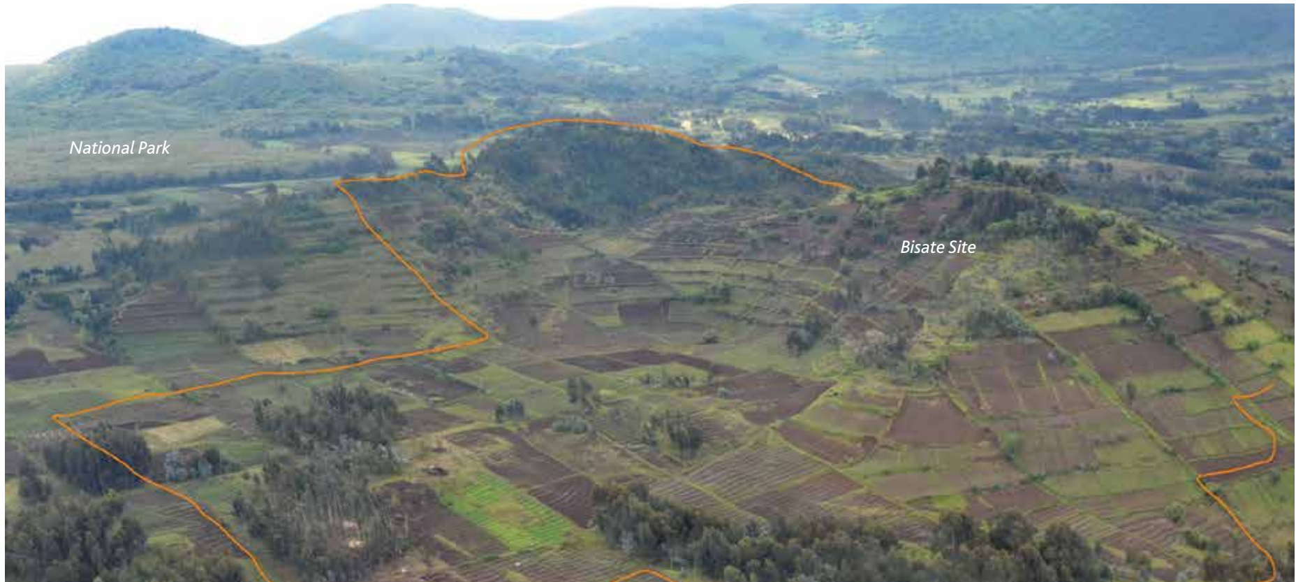
Bisate – meaning 'pieces' in Kinyarwanda – describes the eroded nature of the volcanic cone on which the eponymous Bisate Lodge will be located