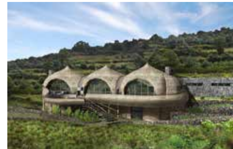
Main Area – at the start of the reforestation

One of the most exciting initiatives is that of reforesting the land in a phased approach using indigenous trees such as Hagenia, Dombeya, Neoboutonia, Hypericum and mountain bamboo. This will lead to a natural recolonisation of this restored forest land by endemic and indigenous bird, amphibian, insect, reptile and mammal species. In terms of birds we expect as many as 15 Albertine Rift endemic species to recolonise the restored forest.