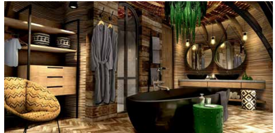
Bathroom Interior – artist's Impression