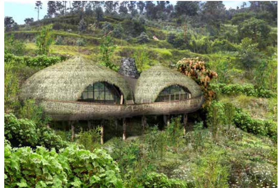
Forest Villa – artist's impression – on current site

With only six villas, the real generosity in the Rwandan context is the amount of private and exclusive space that surrounds Bisate, cossetting it in a rare natural landscape brimming with Albertine Rift biodiversity and beauty.