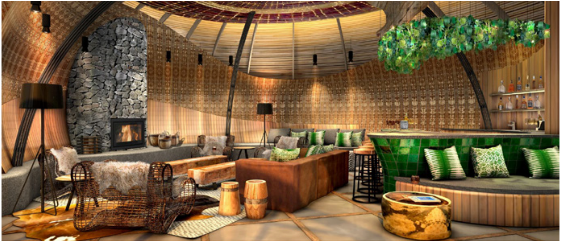
Lounge / Bar Area – artist's Impression

Rwanda is a country of tales and stories to be told and shared, of traditions passed down. Each area in the lodge is thus unique, telling a story itself or providing the setting for storytelling, whether it is the main areas, the decks with their amazing vistas through the cloud-covered mountaintops or the warmly-lit bar area.