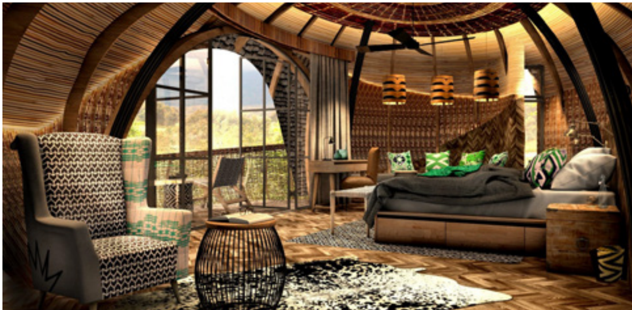
Bedroom Interior – artist's impression

Many of the furnishings are decorated using “imigongo,” an art form unique to Rwanda that uses cow dung and goes back hundreds of years. The dung is mixed with soils of different colours and then painted in geometric shapes. Black and white cow hides are placed to reflect the rural way of life in the villages.