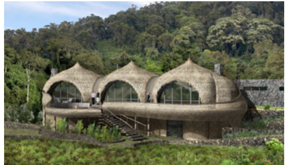
Main Area – artist's impression – with completed future reforestation