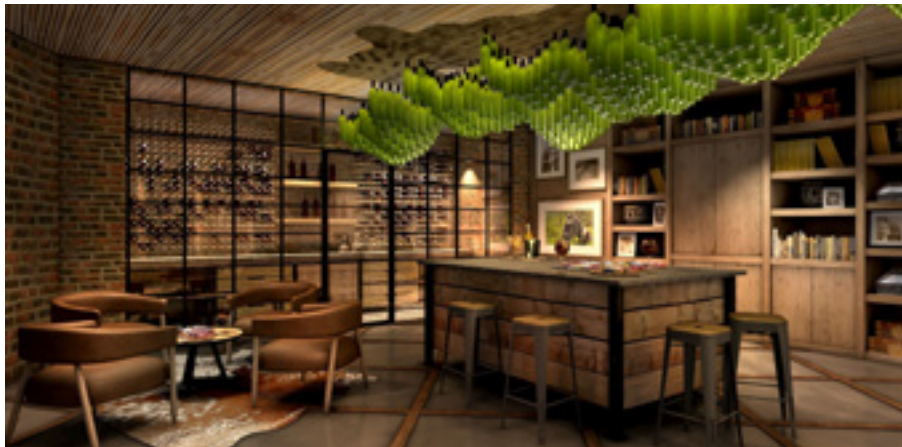
Wine Cellar – artist's impression

Following through with our commitment to the principle of recycling, the chandeliers will be of recycled glass, and the “ibyansi” milk jug motif is reused across a number of elements.