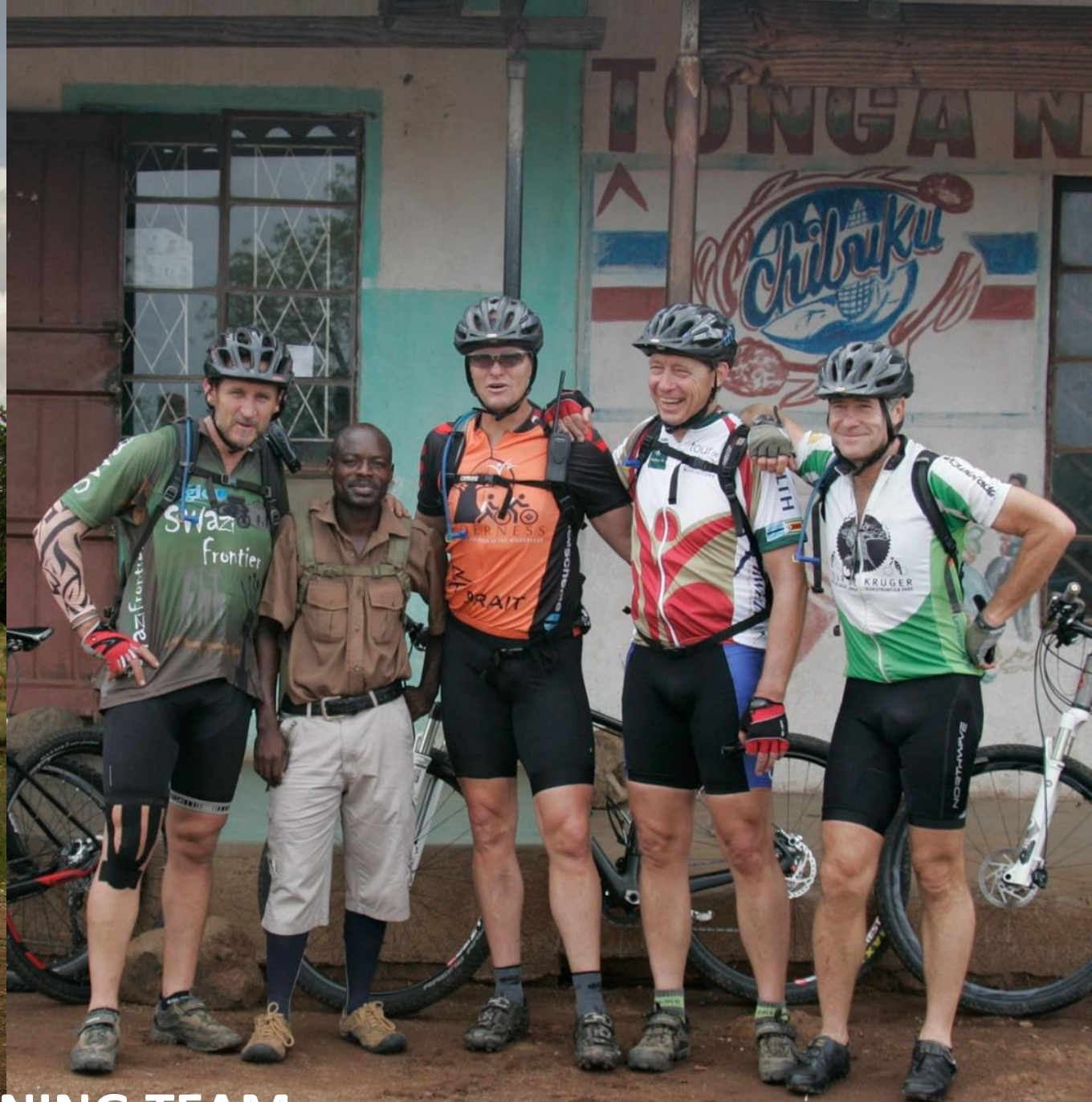
ROUTE PLANNING TEAM