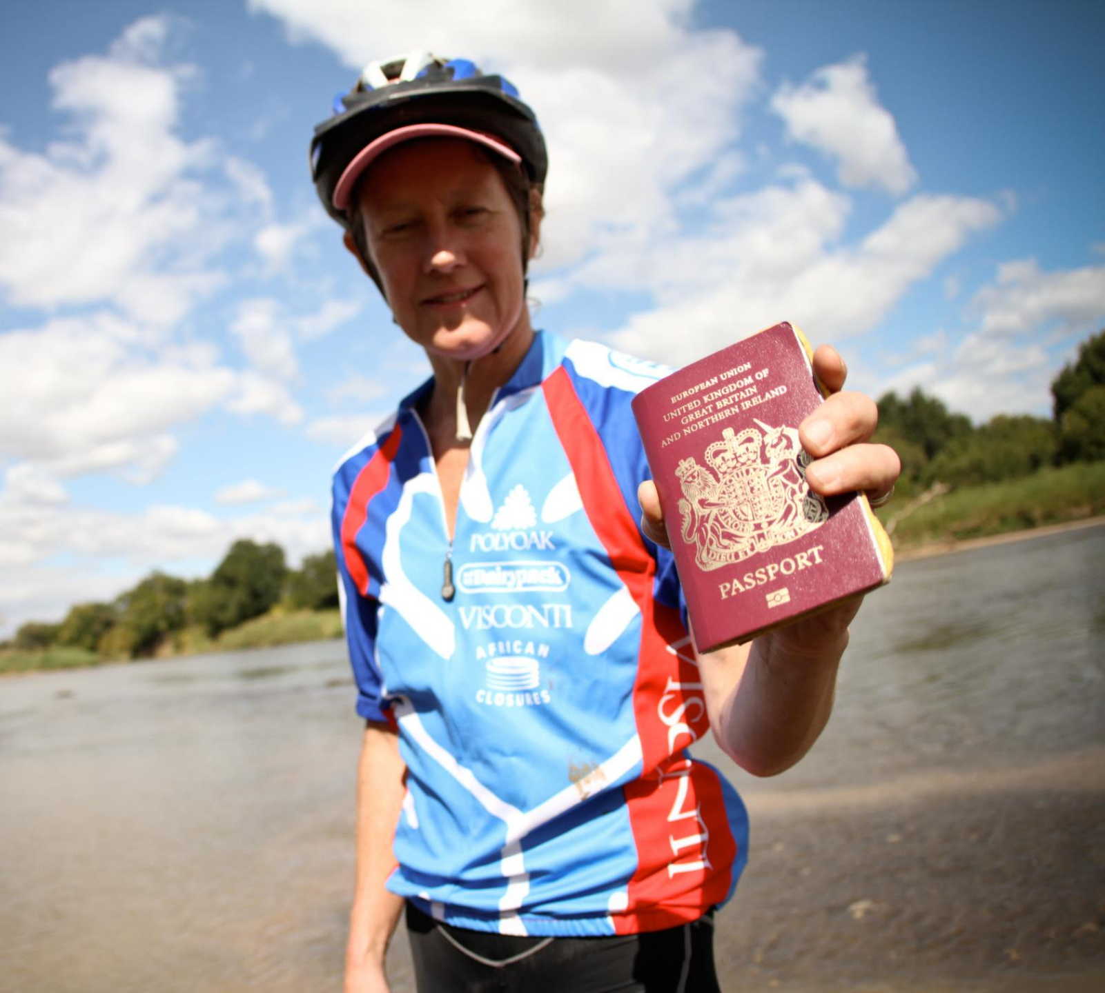
Zimbabwe/SA Informal Border Crossing