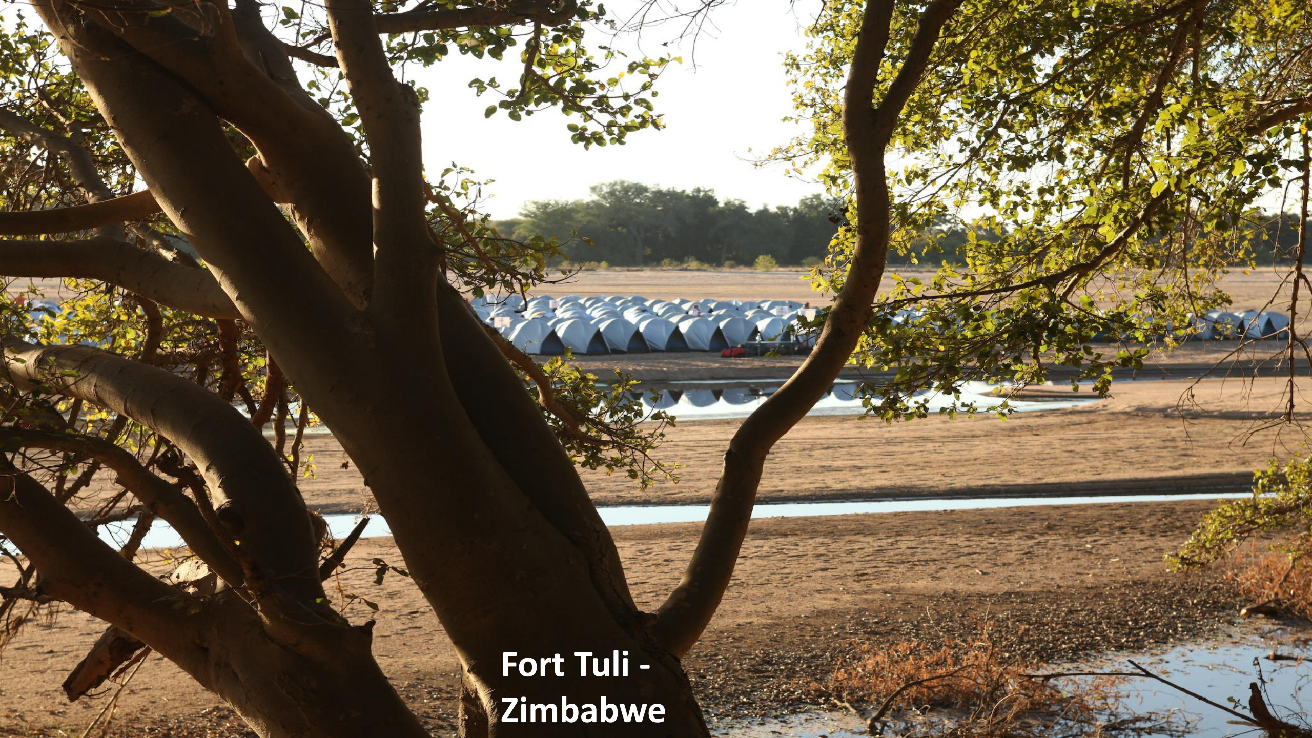
Fort Tuli - Zimbabwe